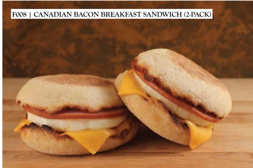
F008 | CANADIAN BACON BREAKFAST SANDWICH (2-PACK)

Tocino, Canadiense, Huevos y Queso Panecillo Premium Canadian Bacon, Egg and American Cheese on our new freshly baked English Muffin. 4.5 oz. each. $6.00