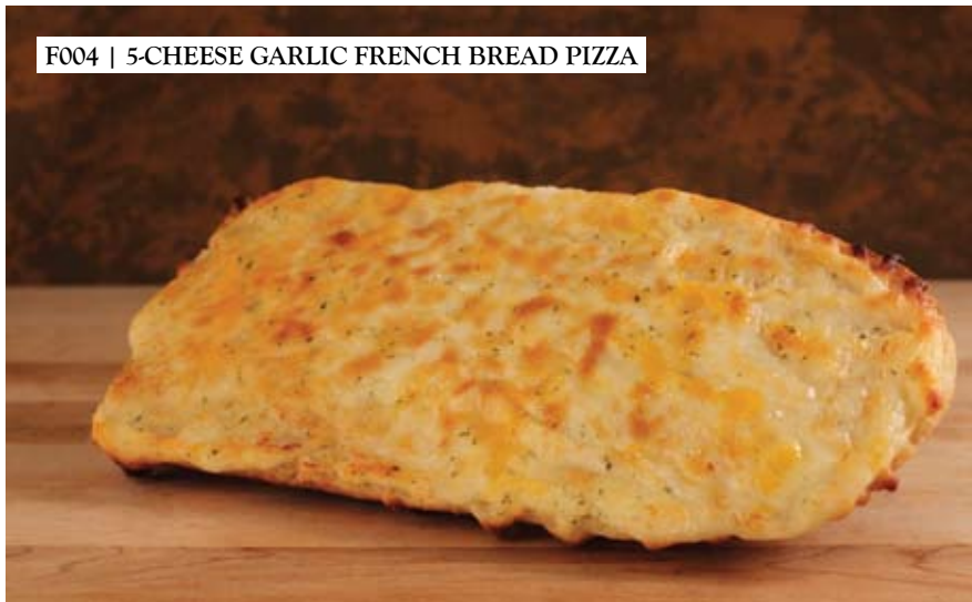
F004 | 5-CHEESE GARLIC FRENCH BREAD PIZZA