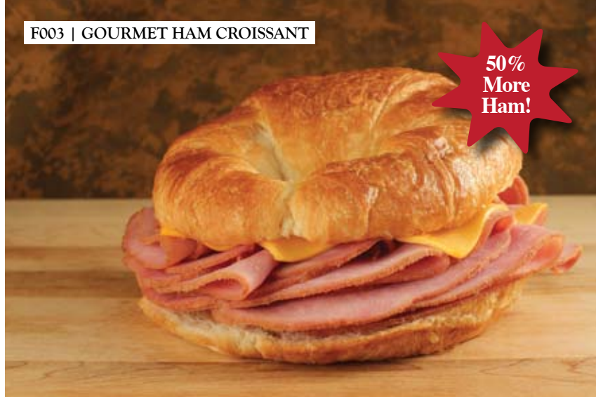
F003 | GOURMET HAM CROISSANT

Croissant de Jamon Freshly cut Premium Ham with American Cheese on our new freshly baked 8" croissant roll. 6 oz. each. $3.50