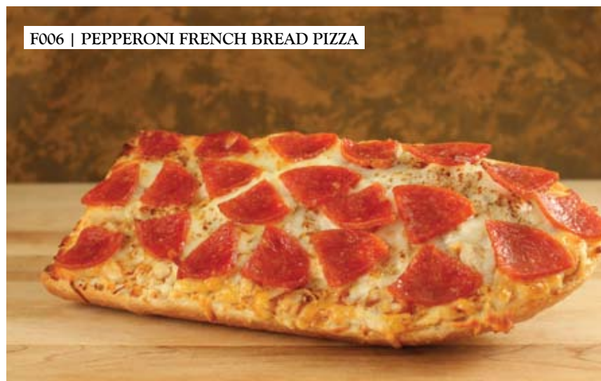
F006 | PEPPERONI FRENCH BREAD PIZZA

Pepperoni, Sausage & Bacon with Mozzarella Cheese on our new freshly baked 8" bun. Comes in our toasting microwavable tray. 5.62 oz. each. $3.50