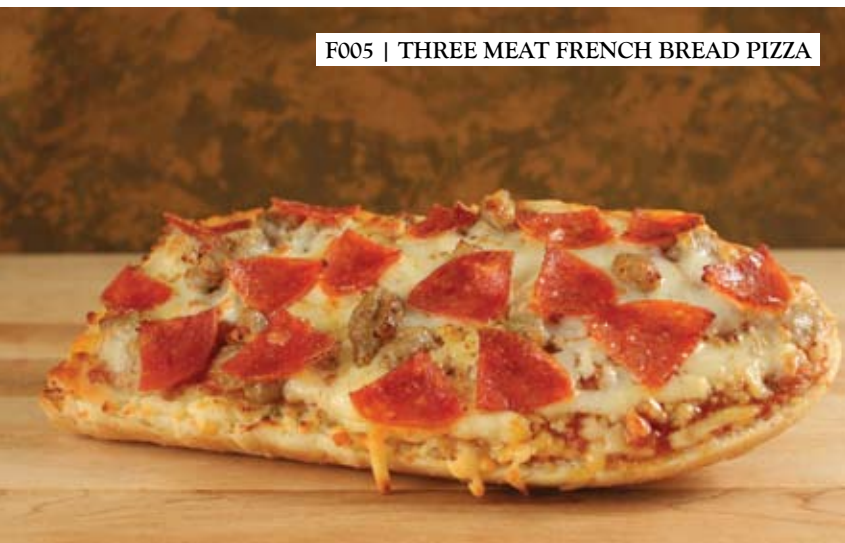
F005 | THREE MEAT FRENCH BREAD PIZZA

Five types of cheese with garlic seasoning top off our new freshly baked 8" bun. Comes in our toasting microwavable tray. 4.33 oz. each. $3.50