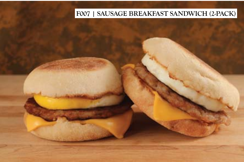
F007 | SAUSAGE BREAKFAST SANDWICH (2-PACK)

Chorizo, Huevos y Queso Panecillo Premium Sausage, Egg and American Cheese on our new freshly baked English Muffin. 5.0 oz. each. $6.00